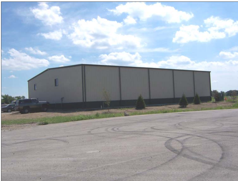
Located at Northgate Business Park, construction of Maddox Excavating, LLC was completed in 2005.

Staff started work with the State on the Indiana Workforce Development Strategy – the new Workforce Development Region Four of which Tipton County is included. The new much larger region consists of 12 counties as the State has reduced the total number of regions. Two county representatives were selected to serve Tipton County – one from government and the other representing the business sector.